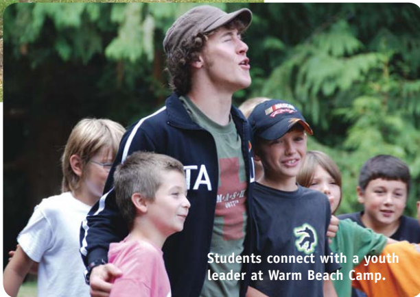
Students connect with a youth leader at Warm Beach Camp.

For information about more retreat destinations, visit us online: www.goingonfaith.com